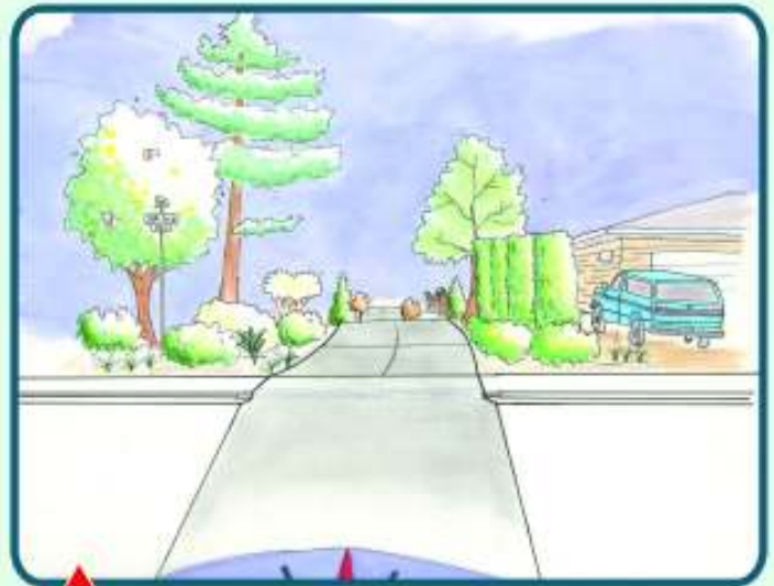
2 View Down McClellan from 18th

The drawings show how the pathway would wind through four blocks utilizing the existing pathways. The thinner path would provide areas for increased plantings while still allowing access to driveways.