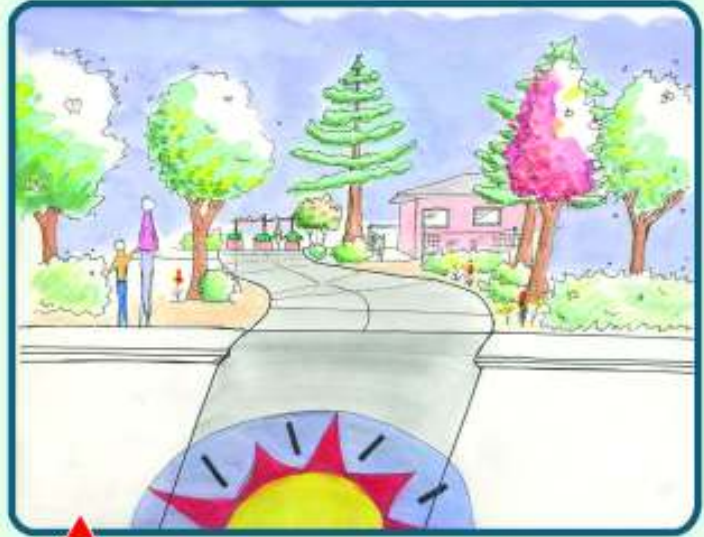
1 View down McClellan from 16th

The pedestrianway is a continuation of the idea to change McClellan from a muddy-gravel road into a pleasant trail that provides residents with easy access to the school and to Mancio park.